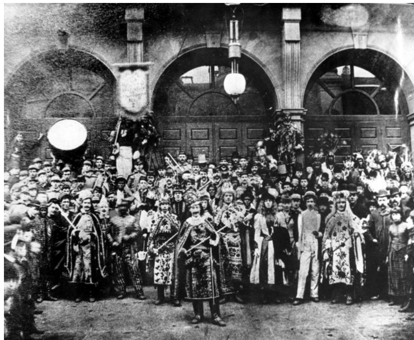
This 1890s shot of the Golden Crown Club is one of the oldest photographs of Mummers known to exist.

As Philadelphia entered the 19th century, widespread economic changes were underway that would have serious implications for the working class who overwhelmingly lived in Southwark and Moyamensing. This period in Philadelphia’s history marked the dawn of industrialization and spelled the decline in the prominence of highly skilled craftsmen within the city’s economy and society.