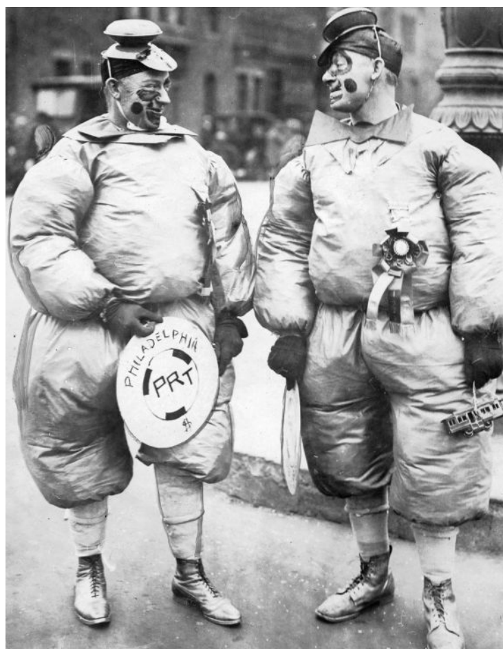
The Lewis brothers of the League Island Club in 1925.

From the Mummers' perspective, the next man to sit in the Mayor's Office was one of their own. Mayor Frank Rizzo hailed from the same ethnic working-class neighborhoods of South Philadelphia as the vast majority of Mummers, and, as far as the Mummers were concerned,