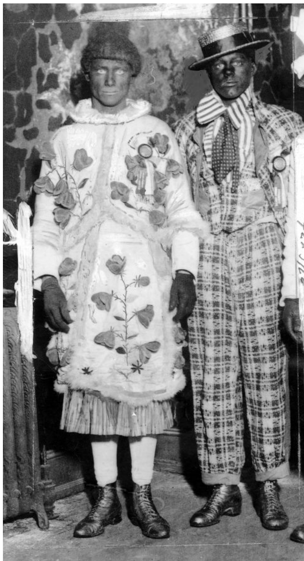
A wench and minstrel dude of the Silver Crown Club in 1920.