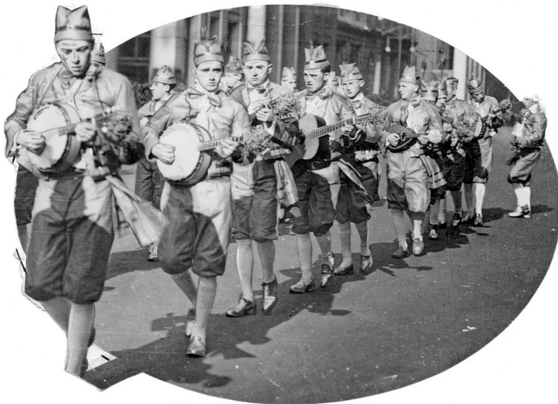
The Quaker String Band strumming along Broad Street in 1921.